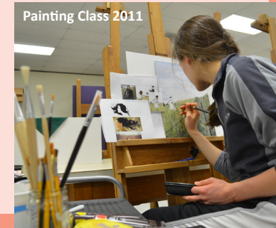
Painting Class 2011