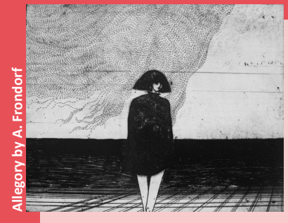
Allegory by A. Frondorf