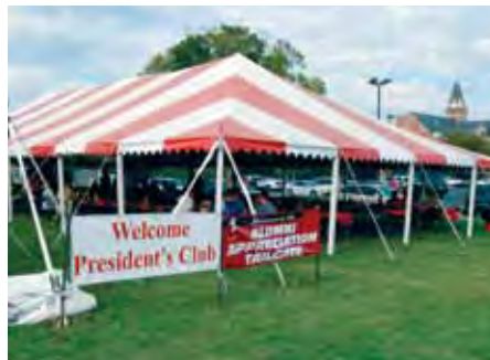
The President's Club Tailgate and Alumni Appreciation Tailgate were combined this year and hosted more than 400 attendees Sept. 19 on the Practice Field.

For the first time, we had the opportunity to partner with the Alumni Association to bring these groups together for a combined tailgate party this year. We had an excellent turnout and filled two large tents with more than 400 donors, alumni, students and their families.