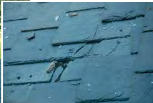
The July 8 hail storm severely damaged the Davis Administration Building’s slate roof. This photo was taken from the fourth-floor northeast window, overlooking the lawn south of the Riney Fine Arts Center. The Vermont Black slate ranges in size up to 18 inches and is approximately one-quarter inch thick.