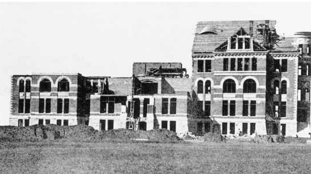
The Davis Administration Building (then Garfield University) under construction in 1886.

Friends University entered a covenant on Dec. 28, 1976, with the National Register of Historical Places and agreed that it would "hereafter repair, maintain and administer said Univer-