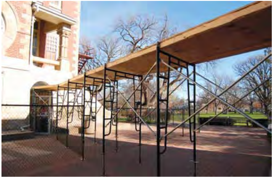
Covered walkways have been constructed at the north, west and south (shown here) entrances of the Davis Administration Building to protect passersby from potentially falling slate. Black, vinyl-coated chain link fencing has also been placed around the perimeter of the building.

Cost is not the main driver, however, for looking into roofing options. Allowing an alternative material may be better for the building. An advantage to a synthetic material would be that it weighs two-thirds less and is much