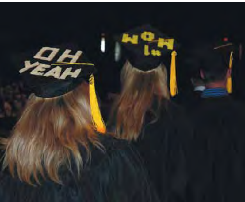
Graduates celebrating Friends University's 109th annual Commencement May 9 at the Kansas Coliseum write messages on their mortar boards.