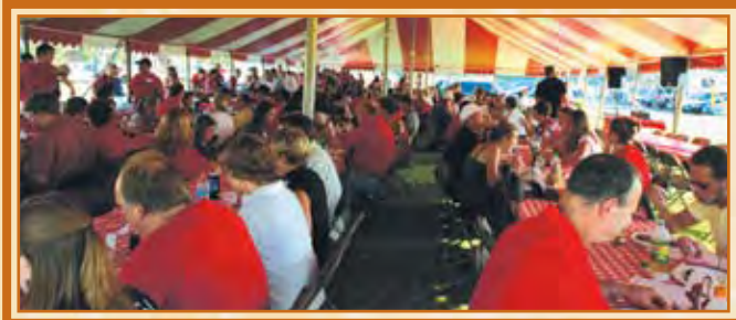
Members of the President's Club dine with Presidential Scholarship recipients and their families Sept. 8, 2007, on the Practice Field before the Falcon football team defeated Sterling College, 24-13. Donations received from the President's Club helped underwrite 165 scholarships during the 2007-08 academic year.