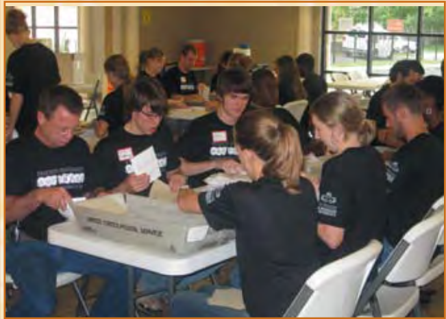
Approximately 65 students, faculty and staff participated in the annual Friends University Community Service Day Aug. 23, 2008, preparing more than 25,000 fundraising mailers for The Lord's Diner. The group accomplished in a few hours what would normally take several shifts of workers to complete.