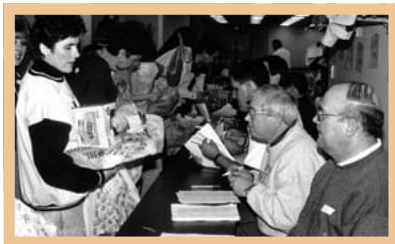
Friends University volunteers double check Santa's list at the first-ever Salvation Army Service Day in 1993.