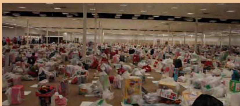
Each year Friends University staff, faculty and student volunteers fill the Salvation Army's Christmas distribution site floor with donated gifts for Wichita-area families. Gifts are grouped by family on numbered cards so they can be easily accessed on distribution day.