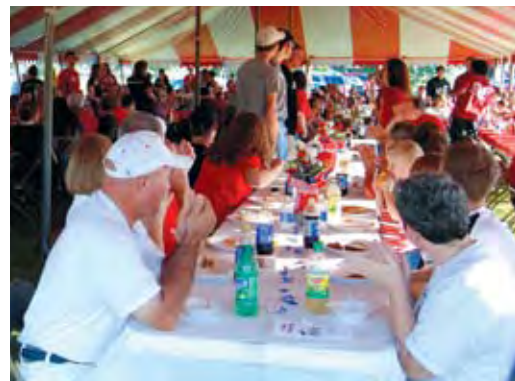
Presidential Scholarship recipients stand to be recognized at the annual President's Club Tailgate Sept. 20.