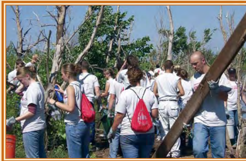
Nearly 100 students, faculty and staff cleared Greensburg tornado debris Aug. 26, 2007, at the Kiowa State Fishing Lake.

Passion for volunteerism is growing all across U.S. campuses, according to the Cooperative Institutional Research Project Freshman Survey, conducted each fall by the Higher Education Research Institute at UCLA. In the 2005 survey, a record-high