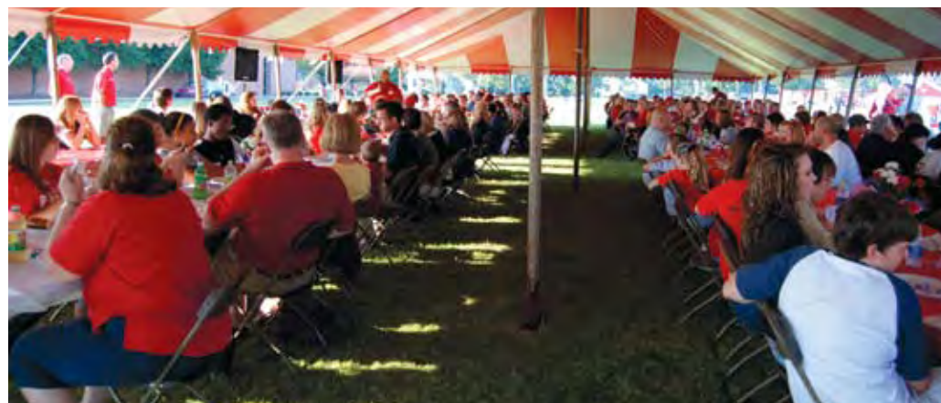
The annual President's Club Tailgate drew 250 guests Sept. 20.