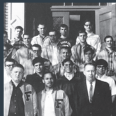
The Singing Quakers prepare to board a plane in Philadelphia for their first European tour in 1968.